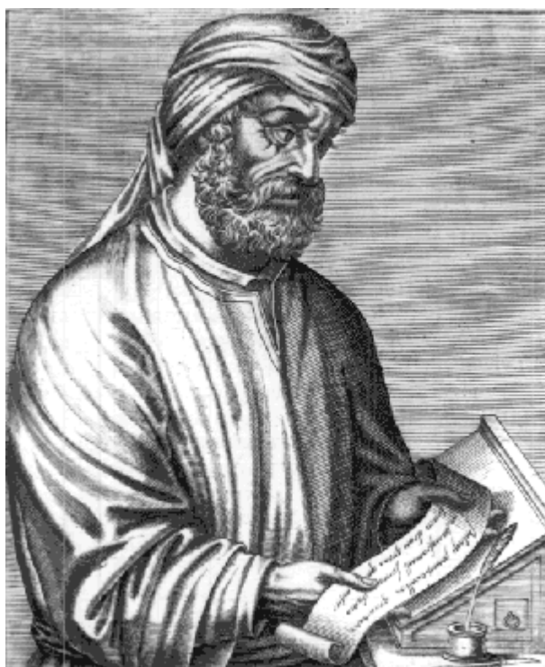
Montanus lived during the second century, very little is known about his personal life.

He is speaking about the dark times in which they are living. He talks about the bloody wars raging and the terrible plague spreading.