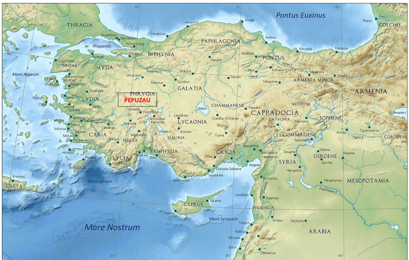
Montanus had many followers in Asia Minor, but also in Europe and Africa. He was a member of the Christian church in Pepuza. The city was destroyed by the Roman emperor Justinian I in 550.

All those people were wrong; the Lord Jesus did not come! We do not know when the Lord will return. Even the angels in heaven don't know.