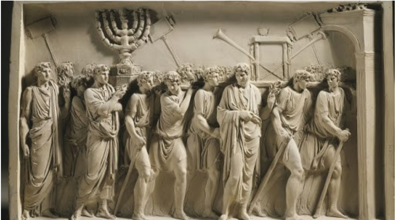
Sculpture of The Arch of Titus showing the triumphal procession after the destruction of Jerusalem in AD 70. Spoils from the second temple in Jerusalem, including the seven branched candelabra, the silver trumpets and the Table of Showbread are

Those Jewish commanders, heavily chained, walk past as well, their heads bowed. John of Gischala is sentenced to life imprisonment. Simon receives the death sentence. They take him to a high cliff and mercilessly thrust him over the edge into the deep ravine so that he is dashed to pieces on the rocks. That is the terrible end of those godless Jewish commanders. They showed no mercy to others; now, no mercy is offered to them. Besides, Jews have become very contemptible. Before then, they were the fiercest enemies of the gospel. But that is past. Yes, they remain hostile, but their power is broken. They have no say anymore. Their influence is gone.