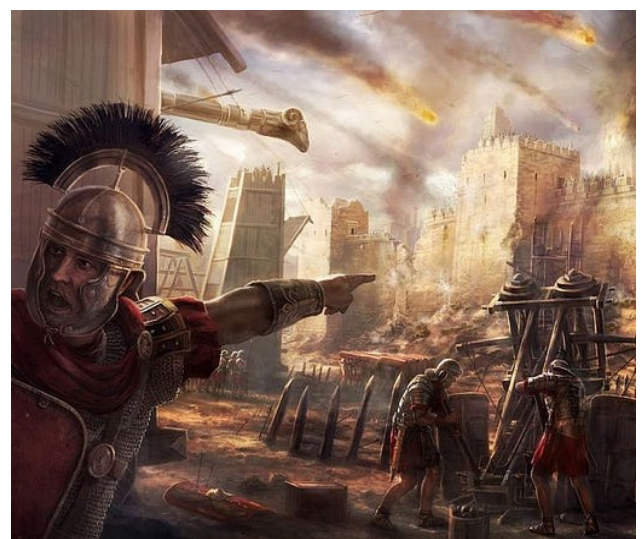
The Romans slaughtered everyone and razed the once mighty city to the ground, including the Second Temple. https://short-history.com/

Nothing helps. The messengers are greeted with sneers and jeers. No matter how well-intended, every proposal of the Roman general is rudely rejected. The Jews believed that the temple