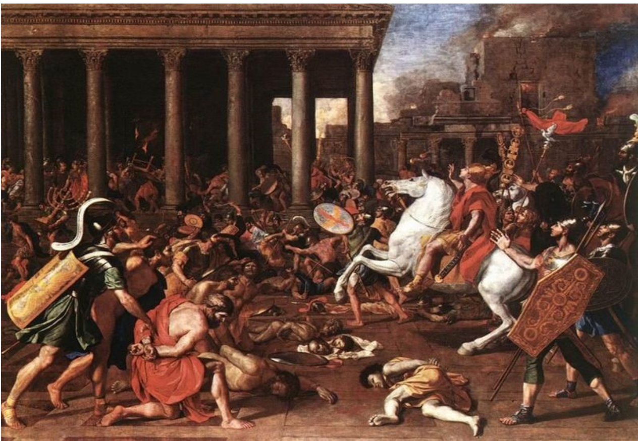
Destruction of Jeruzalem. Painting by Nicolas Poussin.

The terrible judgment of God has come. The Jews have suffered terribly. Over a million Jews, men,