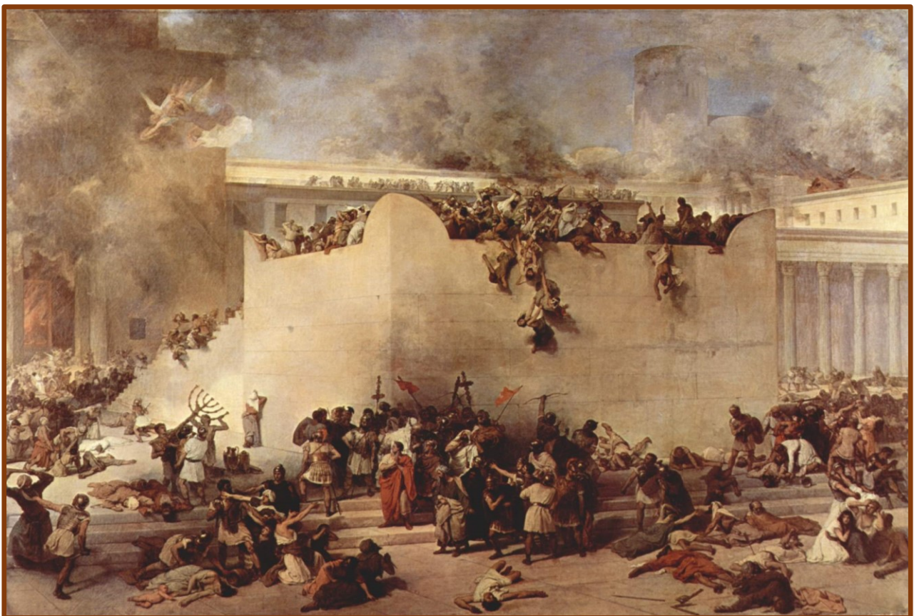
Destruction of Jerusalem - 70 AD. Painting by Francesco Hayez

Titus commands that all soldiers, free from other duties, must work on this project and.... the mammoth task is completed in three days, an incredibly short time! Besides, the wall is reinforced with 30 entrenchments. It has now become impossible for the Jews to sneak out of