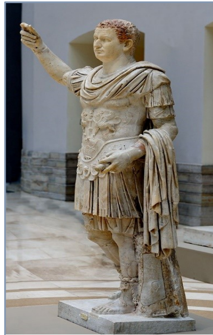
A statue of Titus unearthed in Herculaneum, which can be found in a Berlin museum