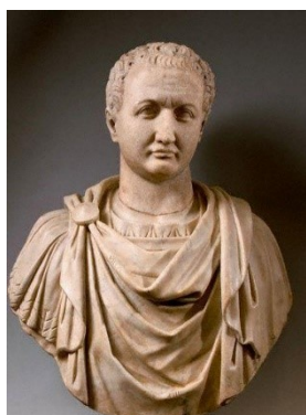
Titus Flavius Vespasianus 39 - 81 AD

Immediately, Titus gives the command to storm the city. The fighting is fierce and murderous, but