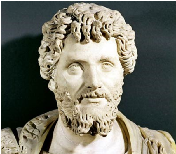
Emperor Severus 145-211 AD

Another emperor ascends the throne of the Roman empire. His name is Severus. This time the new ruler is not a Roman citizen but a man from Africa, an Ethiopian. For many years he had commanded part of the Roman army.