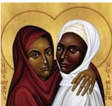
Perpetua and Felicitas

It is several days later. Carthage is celebrating! It is the emperor's birthday, and that's the day the Christians will be put to death. The curious crowds