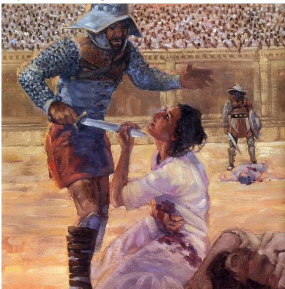
A gladiator with a sword will kill all who are still alive.

In the meantime, the soldiers send the young men into the arena. Leopards and bears are released from their cages and attack their prey. A few terrible moments and the young Christians lie torn to pieces on the ground.