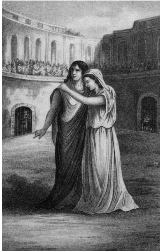
Perpetua and the slave girl Felicitas. Felicitas was eight months pregnant when she died

fill the large amphitheatre to overflowing. Even the streets are full of people. The gate of the prison opens, and the condemned Christians walk