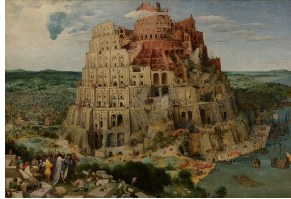
The tower of Babel, the top of which would reach the heavens.

Satan incited many judges and kings to lead the people in idolatry. God punished them with the Babylonian exile but made a remnant return.