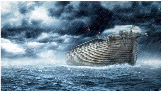
The Flood, a deluge that swept everything away, except Noah and his family

Satan incited the first world to turn their backs to the Lord - but God intervened and sent the flood,