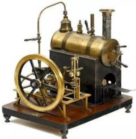
One of the first steam engines

The 18th century was a time of many discoveries