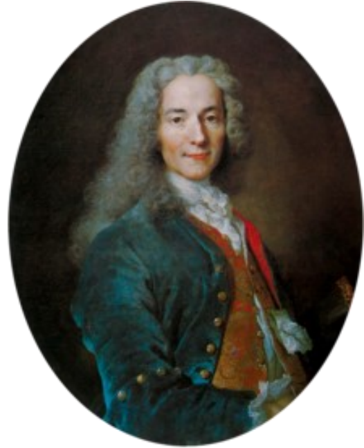
Francois Voltaire 1694-1778

The name of one of those authors was Voltaire . He was the son of a lawyer and educated in a