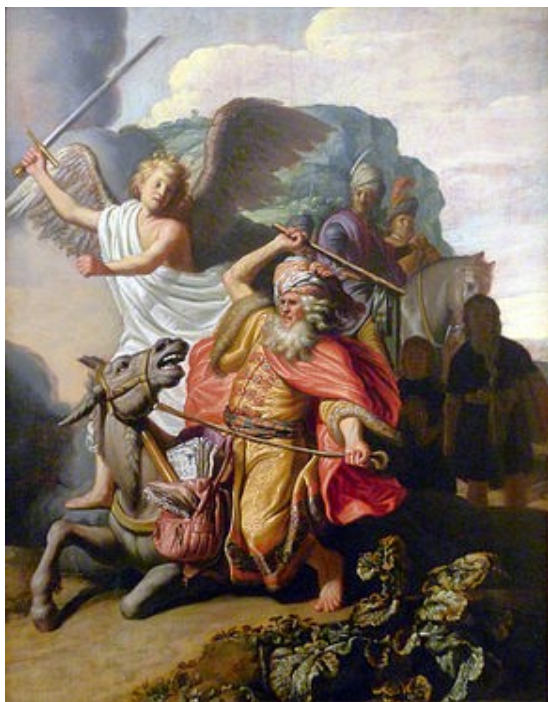
Balaam and the Donkey. Painted by Rembrandt van Rijn.

Yes, very terrible! For God's Word has authority ! Because it is the Word of God and we must believe it unconditionally. The people of the Enlightenment said that the Church teaches those