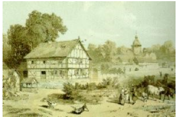
The Luther family house in Eisleben.

He trembled for the consequences of the slightest offence. When he heard the name 'Christ', he turned pale with fear because if his parents and teacher were so strict, how strict must Christ then be? He believed that Christ was a strict Judge who was angry with him because of his sins. When Martin thought about death, he trembled because dying meant 'meeting God'; if that happened, he would go to hell. He was fully convinced of that.