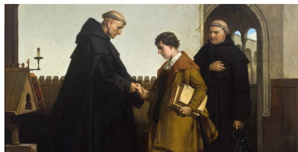
Luther enters the monastery.