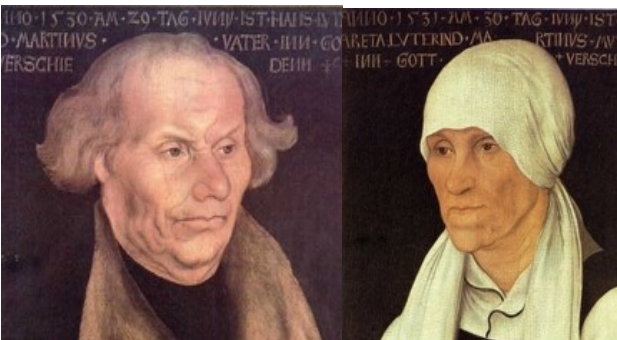
Hans and Margaret Luther, Martin's parents.

Mind you, Martin was used to being beaten. His father, Hans Luther, could also punish him unmercifully for the slightest offence. Luther's dad was very strict in the upbringing of his children. He was too strict!