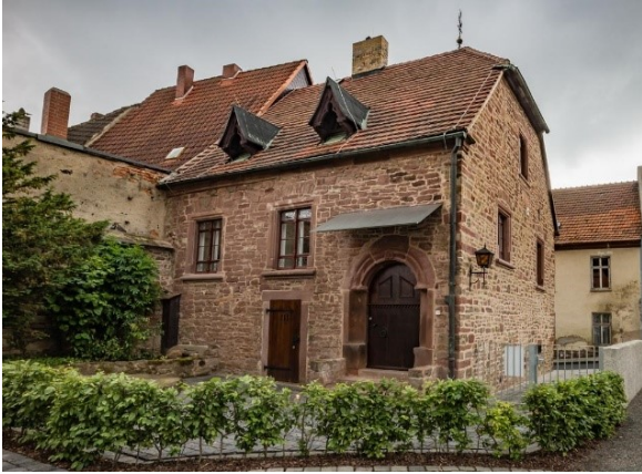
Fam Luther's house in Mansfield.

These days all children must go to school by law, but not then. Most boys and girls never went to school and could neither read nor write. Martin was privileged to be able to go to school and learn the basic skills of reading and writing. They also had to learn 'The Ten Commandments', 'The Articles of Faith', 'The Lord's Prayer' and some other things. God had given Martin a clear intellect, and his father allowed him to further his studies. First, he went to a school in Maagdenburg for one year. After that, he enrolled at a school in Eisenach.