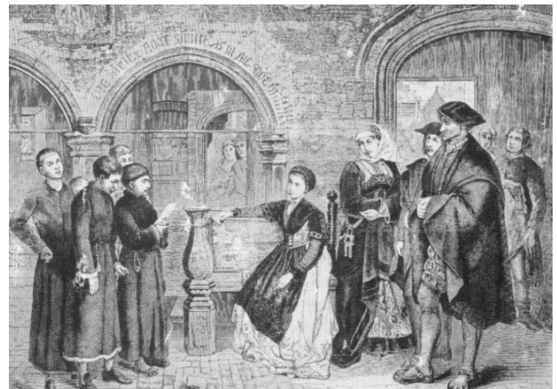
Luther went singing past the houses to get some money or food.