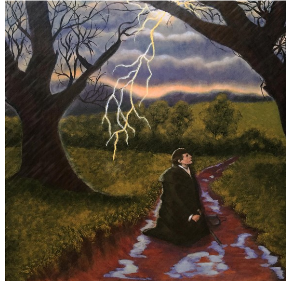
"Help me Saint Anna, I shall become a monk!"

Suddenly a sharp flash of lightning lights everything up with an eerie blue glow. At the same time, there is a loud crash of thunder right overhead! The lightning strikes the earth right next to him; the sudden air pressure change throws Martin to the ground. The fear of death shows in his eyes.