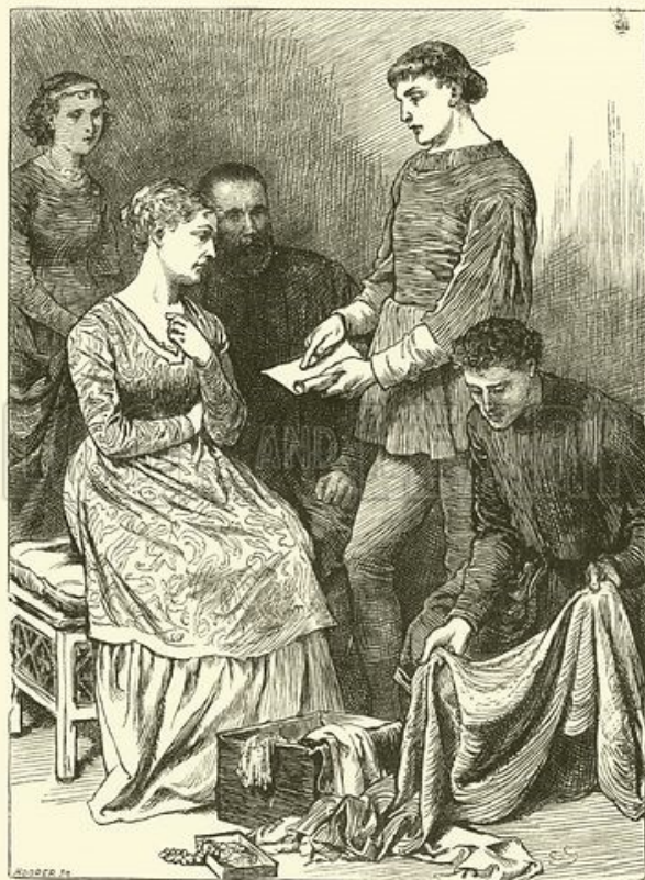
Waldensian missionaries disguised as peddlers.

This remark makes the lady very curious. Surprised, she looks at him and asks: