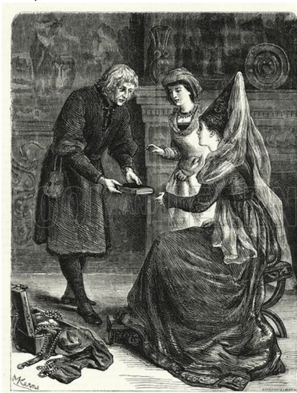
Waldensian missionaries disguised as peddlers.

The woman immediately sees that these men are marketing valuable, good quality items. She has seen lots of door to door salesmen, but most of them had worthless rubbish in their backpacks. Many of them were also rude and insistent in