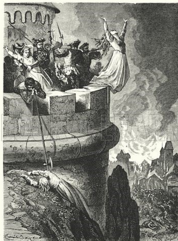
Girls trying to escape the soldier's rude advances.

We explained in the previous chapter that there were always people who wanted to make changes for the better during those dark times. But every attempt to improve the situation met with resistance from the Roman clergy. The bishops of the various cities were supposed to seek out the heretics. Everyone who deviated from the doctrine of the church was called a 'heretic'. The bishops had to find those heretics, examine, and punish them. But according to the pope, those bishops were too soft on those accursed heretics.