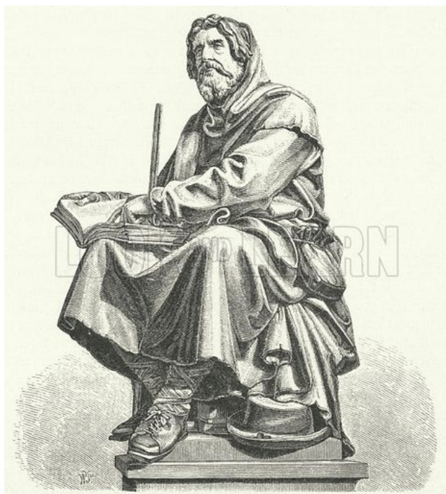
Peter Waldo.

Because he was wealthy, he could - and did - enjoy life to the full. He hosted many extravagant dinners and parties, where he and his friends became quite merry. He did not worry about the serious side of life. He kept thinking: 'Not now, that's for later.' He decided he would first enjoy his wealth.