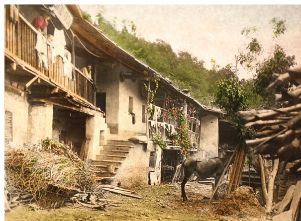
A Waldensian courtyard.

Through their inspired preaching, they prepared the way for the Reformation in many parts of the country