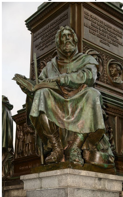
Statue of Peter Waldo at the Luther Monument in Worms.

A gang of murderous soldiers are approaching their village. They must quickly leave their safe, warm homes and escape into the desolate mountains. The women and children walk at the front. In the rear come the men who are carrying on a bitter fight with the pursuing papal soldiers