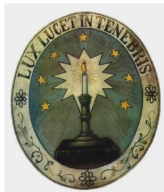
The traditional emblem of the Waldensian church is a candle on top of a Bible. The motto above the symbol reads "Lux Lucet in Tenebris," meaning "a light shining in the darkness." Public domain

Roman priests. Their actions were completely different from the actions of other peddlers. They were not abusive; they did not curse; they did not threaten. They performed their tasks calmly and with dignity. Cheerfully they went from house to house. Their conduct inspired confidence. And so, it was not surprising