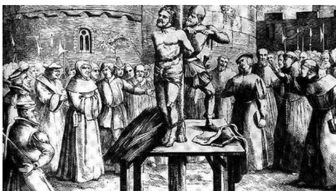
Massacres against the Waldensians http://metalonmetalblog.blogspot.com/

The Waldensians, those faithful witnesses, were so cruelly and abominably persecuted that we cannot describe it. Just as they preached crusades against the Muslims, the Roman Catholic clergy now preached crusades against the Waldensians.