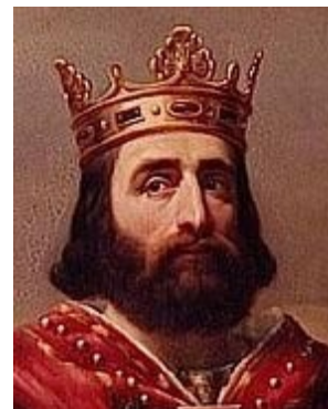
Charles Martel 686 (?) -741 Quora

Their cry of: "Allah is great! Allah is great!" is frightening. With it, they try to make the Christians flee. They have always been successful with that fearsome chant, and they count on that success again. They already rely on being victorious.