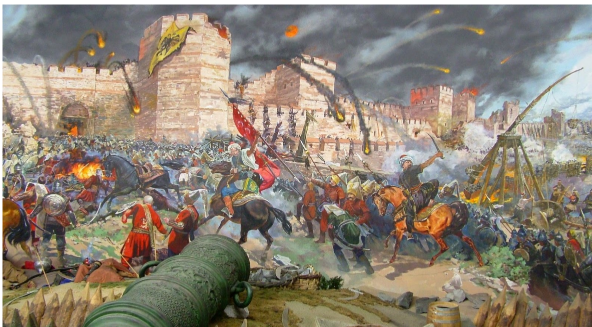
Constantinople prepares for siege. Weapons and Warfare