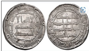
Islam would not allow images of their Caliphs, that was considered blasphemous. Instead they struck a coin in remembrance of an famous Caliph. Wikipedia

R egrettably, after the death of Mohammed, Islam did not disappear. On the contrary! His followers continued the 'Holy War' unabated. These followers are also called 'caliphs.' Those caliphs continued to strive for Mohammed's aim