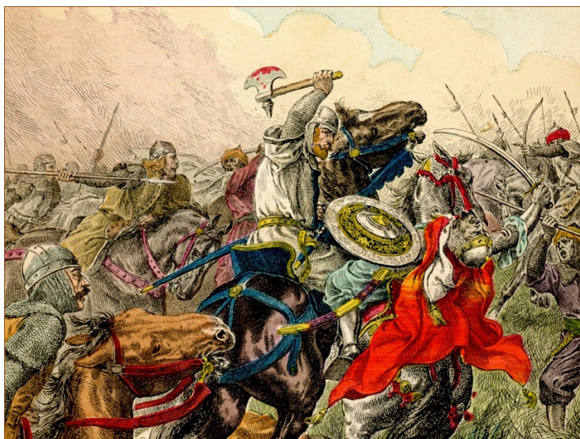
Battle of Tours, France 732 AD. https://halfarsedhistory.net/