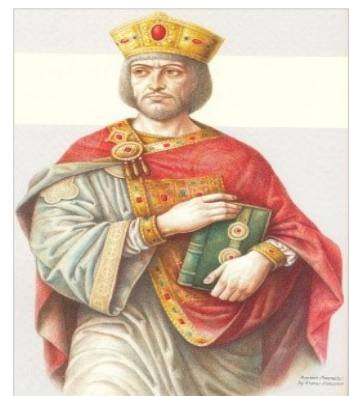
Emperor Leo III.

twice, but both times, the imperial armies repulsed the enemy with much bloodshed. The emperor set fire to the ships the Mohammedans had used to cross the Bosphorus River. This act caused thousands