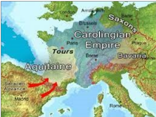
Battle of Tours where Martel took his stand.

The struggle is dreadful and horrific. But this time, the Christians do not flee. They stand immovable and firm and repulse all the attacks of the Mohammedans. There is much bloodshed. At dusk, the battle's outcome is not yet clear, and the fighting, with all its accompanying noise, continues with undiminished severity. Who shall win?