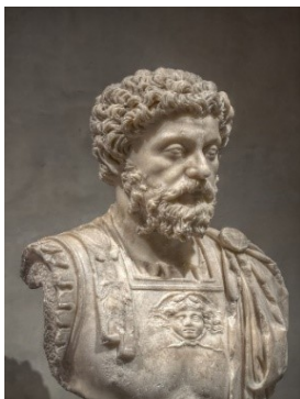
Marcus Aurelius 121-180 ad.

They met on the appointed day. Justin spoke so passionately and effectively that eventually, the highly educated man no longer knew what to say. Justin brilliantly won that debate. That pagan scholar could not stomach that. Furiously, he