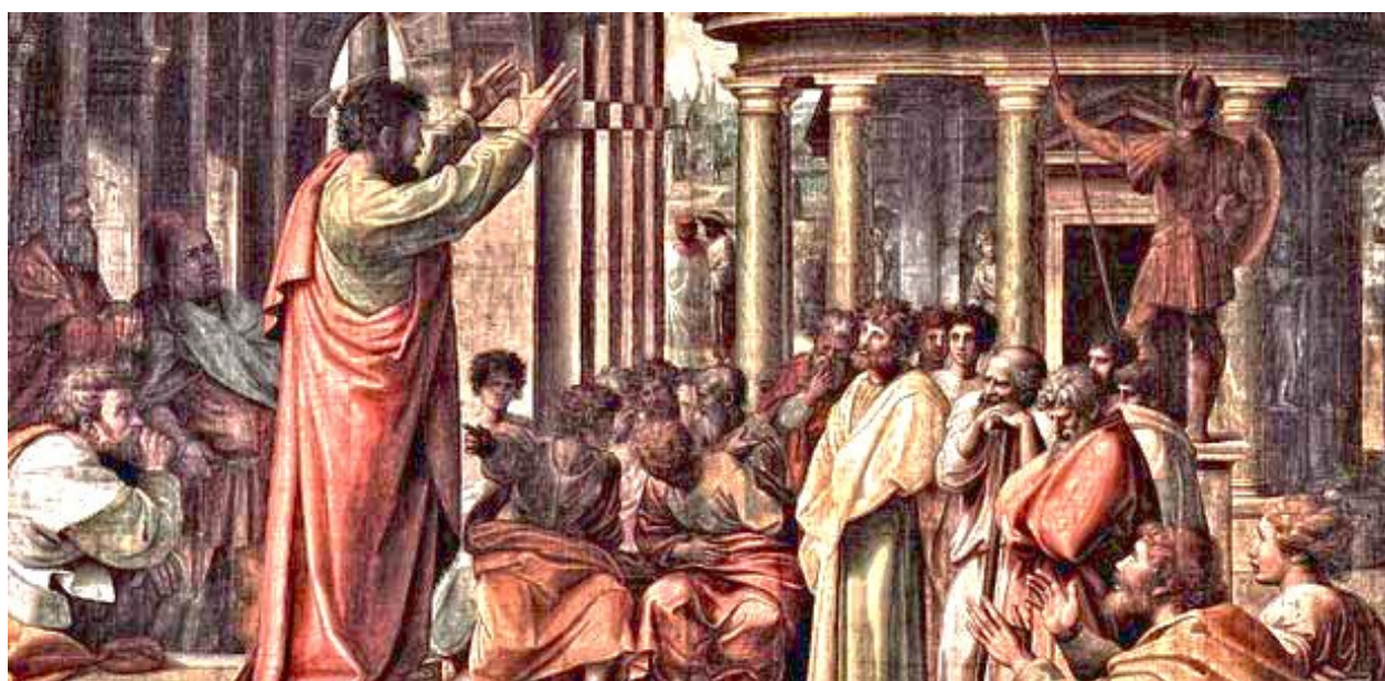
Now he preaches in the many congregations he visits... https://www.fministry.com/