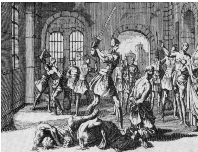
Rough soldiers whipped and beheaded Justin.

"Is that so," sneers the governor, 'and what do they teach?'