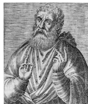
Justin in debate.

Eventually, he returned to Rome, where he founded a school to instruct young people in the doctrine of salvation. You can imagine that the pagans did not like this and became hostile.